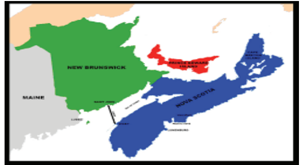
US and Canada